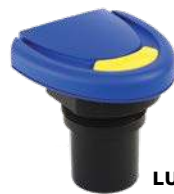
ECHOSONIC® Ultrasonic Level Transmitter