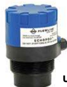
ECHOPOD® Ultrasonic Level Transmitter