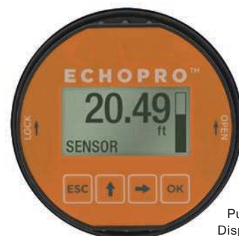
Push Button Display Module