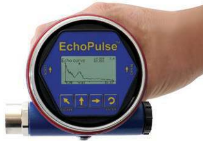
Echo Signal Return Curve Shown