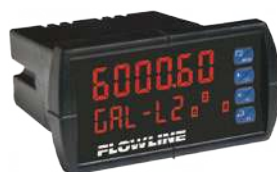
LI55 DATAVIEW™ Level Controller