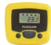
LI40 PODVIEW™ Level Indicator