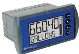
LI23 DATALOOP™ Level Indicator