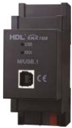
Figure 1. KNX USB Interface